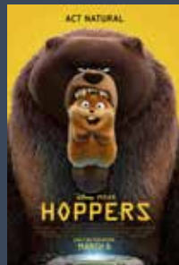
August 7 @Athletic Field