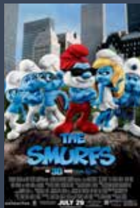
July 24 @Aquatic Center