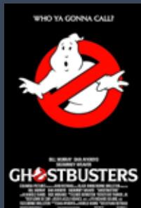
July 10 @Athletic Field

COME WATCH A FAMILY FRIENDLY MOVIE FOR FREE AT THE PARK DISTRICT MOVIE BEGINS WHEN THE SUN GOES DOWN