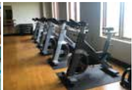
LIFE FITNESS ROOM