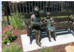
ANDERSON MEMORIAL PARK