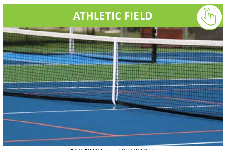
AMENITIES > BUILDING > 407 EAST NORTH STREET | GENESEO, IL