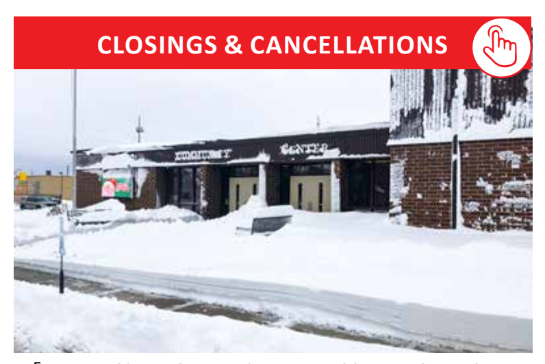
FIND THE MOST UP-TO-DATE FACILITY AND PROGRAM INFORMATION AT GENESEOPARKDISTRICT.ORG/CLOSINGS-CANCELLATIONS