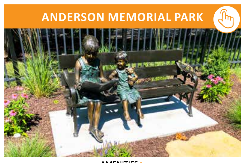
AMENITIES > 316 EAST MAIN STREET | GENESEO, IL