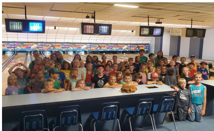
Field trips included in Summer Day Camp thanks in part to the

1 Dates subject to change based on Geneseo School District 228's calendar. Camp will begin the day after school is released for summer session & end the day before school begins for the 2023 - 2024 year. Fees will be prorated. Summer Camp is not held on 4th of July.